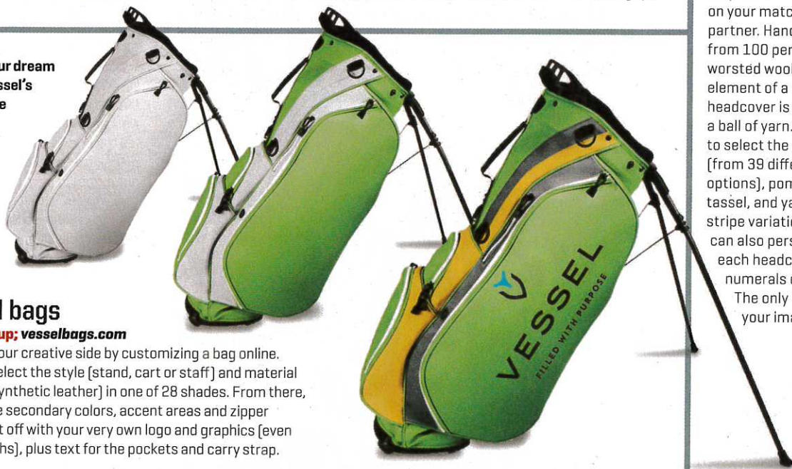
CLUBHEADS: COURTESY CLUBCROWN; GRIPS: COURTESY PURE GRIPS; BAGS: COURTESY VESSEL; HEADCOVERS: COURTESY JAN CRAIG HEADCOVERS

Exercise your creative side by customizing a bag online. To start, select the style [stand, cart or staff] and material [nylon or synthetic leather] in one of 28 shades. From there, choose the secondary colors, accent areas and zipper color. Top it off with your very own logo and graphics [even photographs], plus text for the pockets and carry strap.