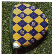
ClubCrown full-head stickers (above) and the ClubCrown Stripe (left).